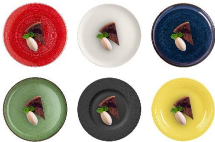
The power of colour: celebrity chef Jozef Youssef conducts a survey exclusively for Ambiente.

You eat with your eyes – the eating experience is by no means limited to the sense of taste: the type of food prepared, how the food is presented on the plate and the tableware used all play a decisive role. Studies show that even the colours of the food can have a strong influence on the perceived taste of a dish. 1 But does this effect also apply to the colour of the tableware? Jozef Youssef, the award-winning celebrity chef and creative force behind the design studio Kitchen Theory, conducted a survey exclusively for Ambiente, entitled "The power of colour: a survey on how coloured tableware influences the perception of food". Using an online survey, he shines a light on how the colour of plates affects the perception of desserts.