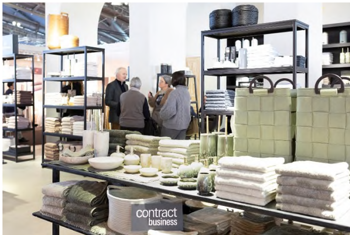
Contract business solutions for equipping and furnishing commercial objects are increasingly in demand - like here at Aquanova at Ambiente 2024.

Frankfurt am Main, March 2024. The consumer goods fair Ambiente is a global meeting point and place-to-be for all professionals involved in design and interior design in the hospitality and office sectors. Networking was made easy for specialised exhibitors and international trade buyers: the stands with matching products for the contract business were marked with the Special Interest Contract Business - the Contract Business Guide displayed on the exhibition grounds also provided orientation and pointed the way to relevant business partners.