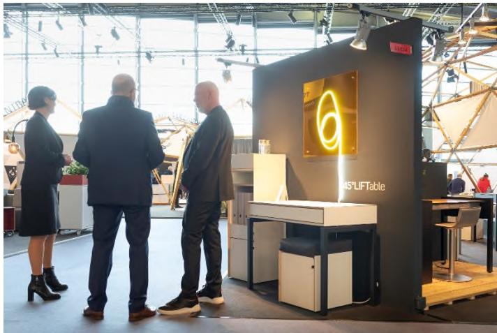
The Future of Work area was one of the highlights of Ambiente 2024, attracting many contract furnishers - like here at Country Living.